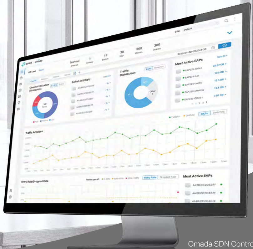
Omada SDN Controller